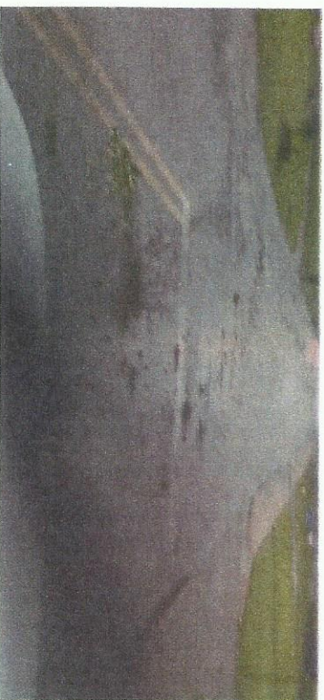
Grass in the streets causes wrecks & flooding!