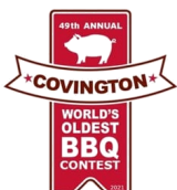
UNDER THE RADAR