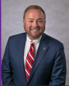
Mayor Justin Hanson

200 W. Washington Covington, TN 38019 901-476-9613