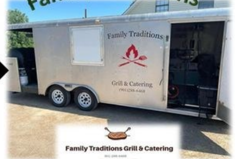
Family Traditions Grill & Catering

While you are here, if you get hungry stop by and purchase Food from Family Traditions